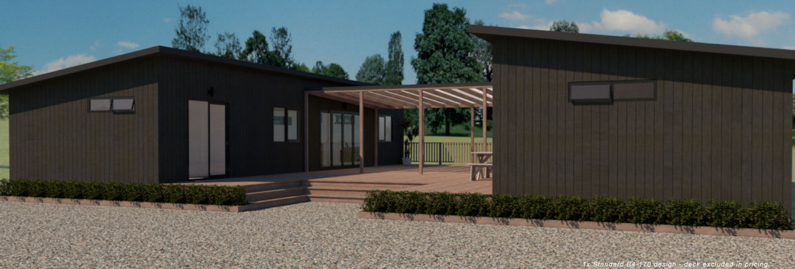
1x Standard B4-170 design - deck excluded in pricing.