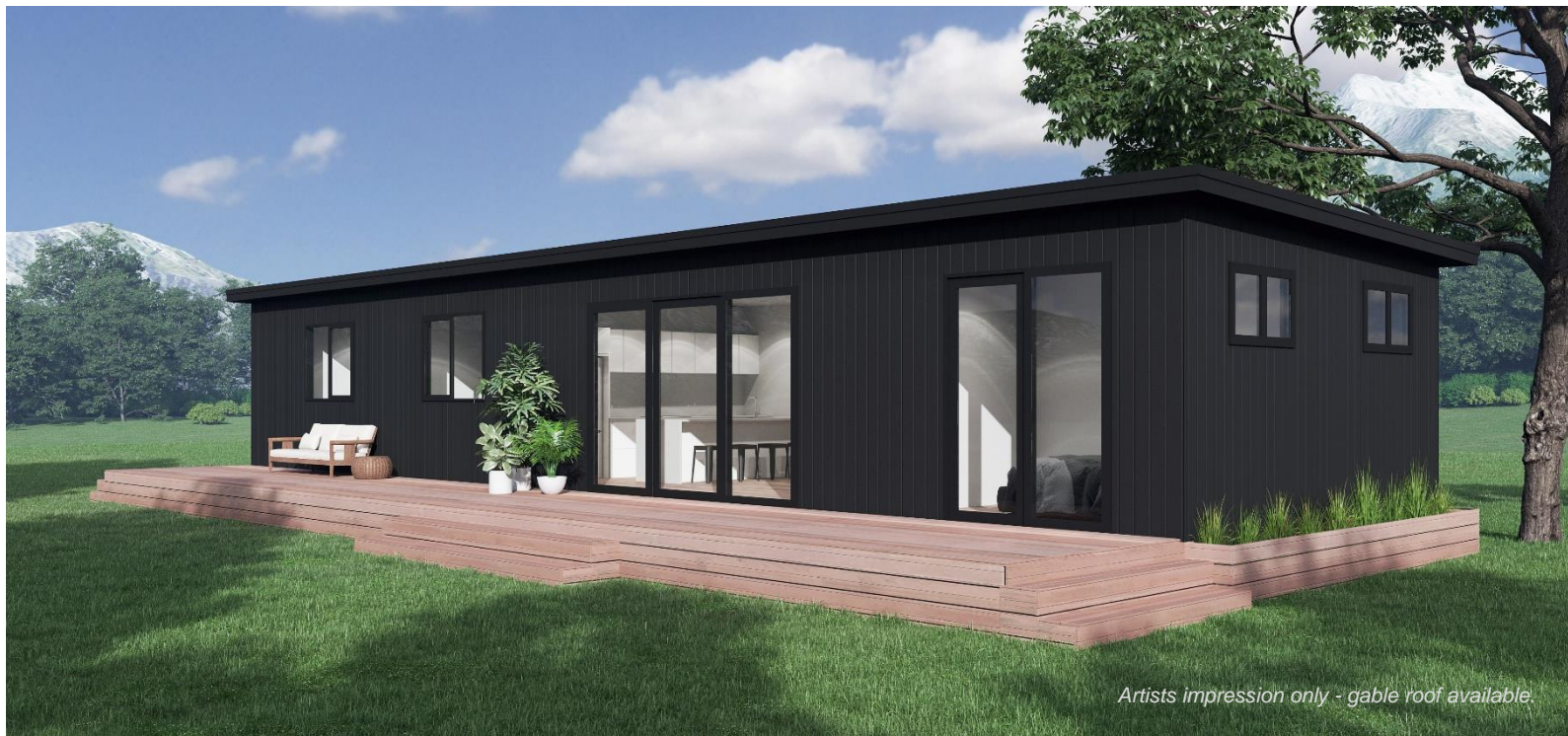
Artists impression only - gable roof available.