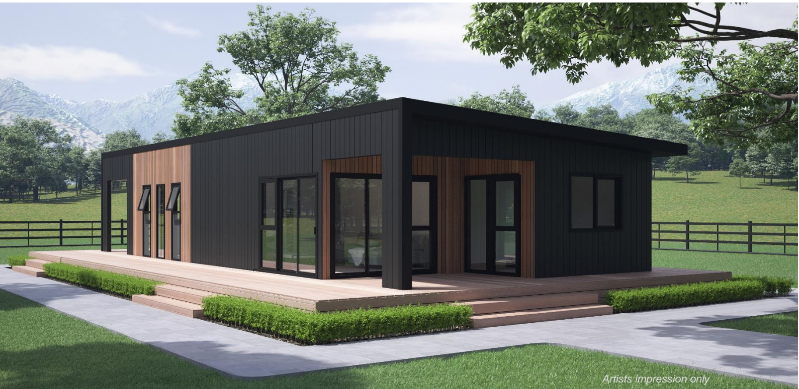
Artists Impression only