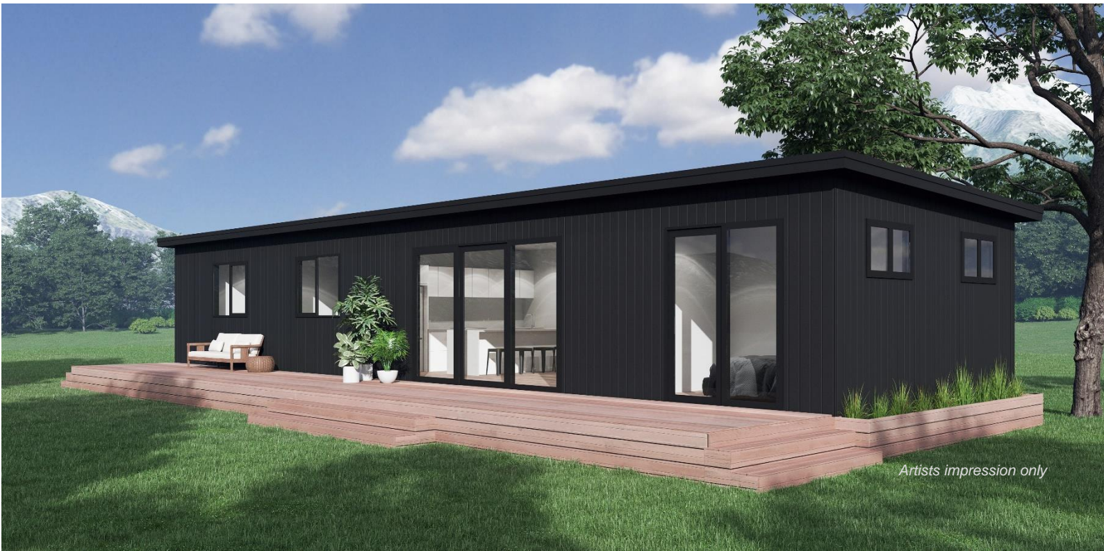
Artists impression only

2 | 1 | Floor area: 84 m 2 | Size: 16m x 5.25 m