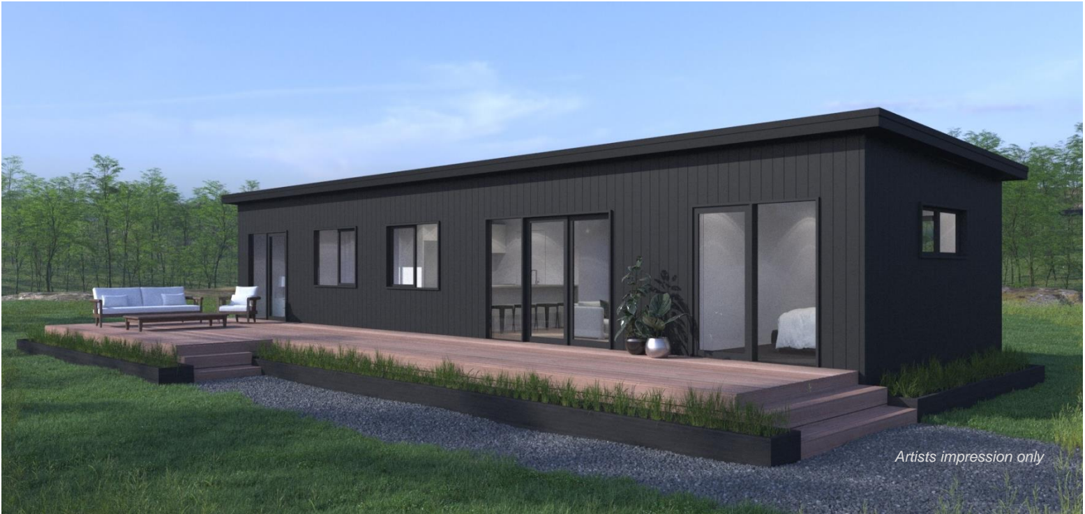
Artists impression only

2 | 1 | 1 Floor area: 70 m 2 Size: 15.2m x 4.6 m